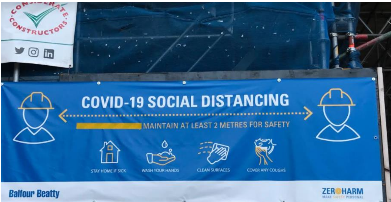
Figure 1. Example of the Social Distancing Sign and Barrier at Construction site.

instructed social distancing sign and the barrier at the construction site for keeping the social distance between workers.