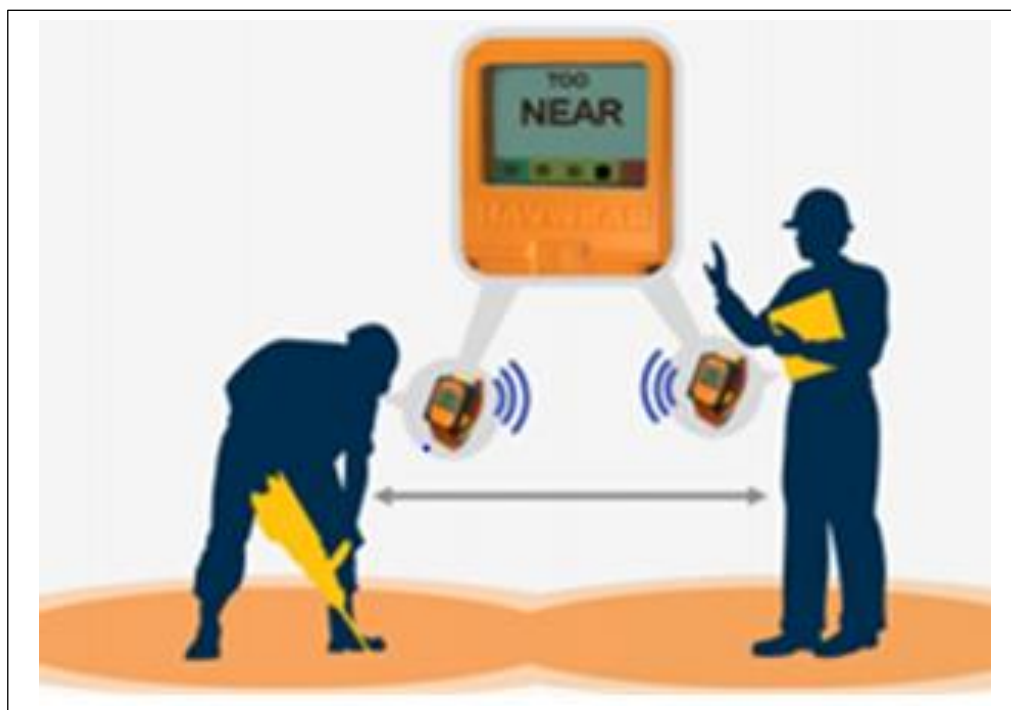
Figure 2. To manage that Social Distancing between workers is maintained.

To study the contacting time between workers in the construction worksite, the contacting time (times of workers within 2m distance) of workers wearing HAVwear at the worksite was measured before and after they were followed HAVwear Social Distancing information from the HAVwear as shown Figure 2. The experiment was performed on 4 different weeks as shown in Table 1.