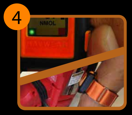
4. Before using each tool, press & release the HAVwear button once and place the HAVwear over a tool tag until a beep sounds, to "Connect" to the tool. The display will show the last 4 characters of the tool ID to confirm connection.