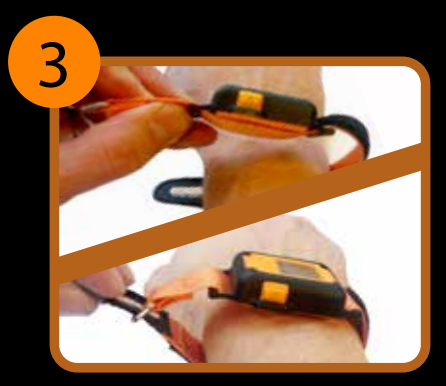
3. Insert HAVwear into the holder so that the strap is in contact with the wrist. Snugly fit the strap around the wrist (do not remove until returning to a Docking station).